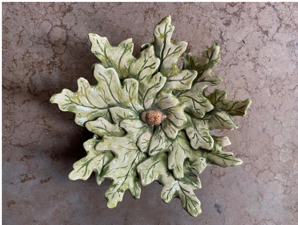
Oak & Acorn by Polly Beach

For more information about workshops and community events, please see http://www.clayfolk.org/events/ and http://www.clayfolk.org/about/