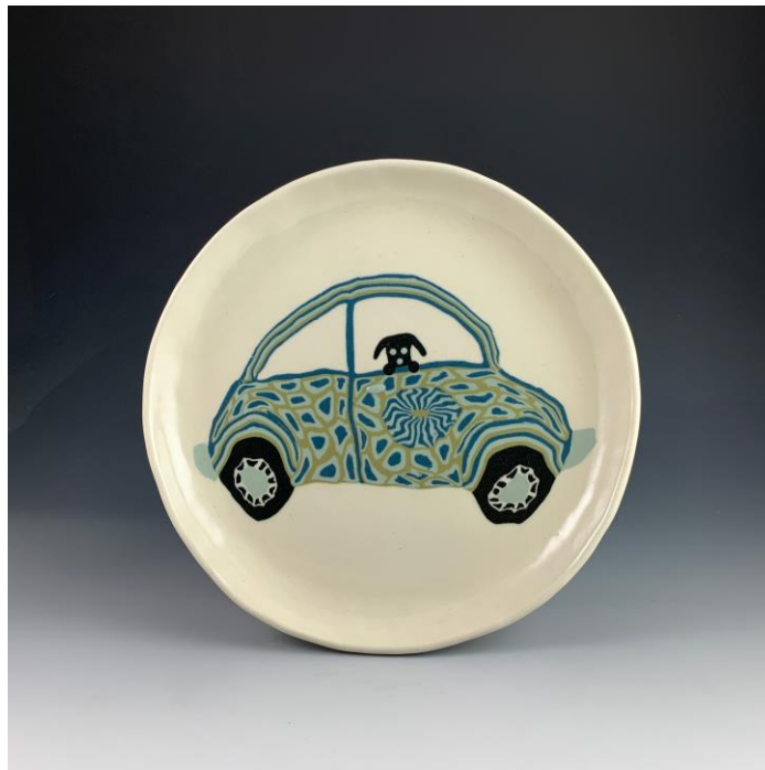
VW Bug Plate by Faith Rayhill

Sunday November 20 – 10:00 AM to 3:00 PM