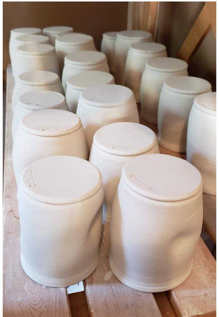
Cups by Russell Richmond

5. Updates on the application list will be posted on the Clayfolk website as soon as practical up to the week before the Show. You can also find out if we received your Show Application on the Clayfolk website, and the final list will appear after the application deadline has passed.