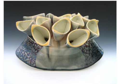
Workshop UPDATE Pg. 3