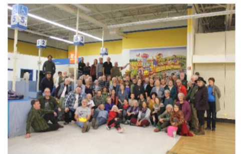
Show RECAP Pg. 4